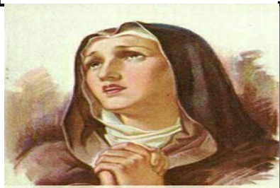
Those who meditate on my Seven Sorrows will be protected by me at every instant of their life.